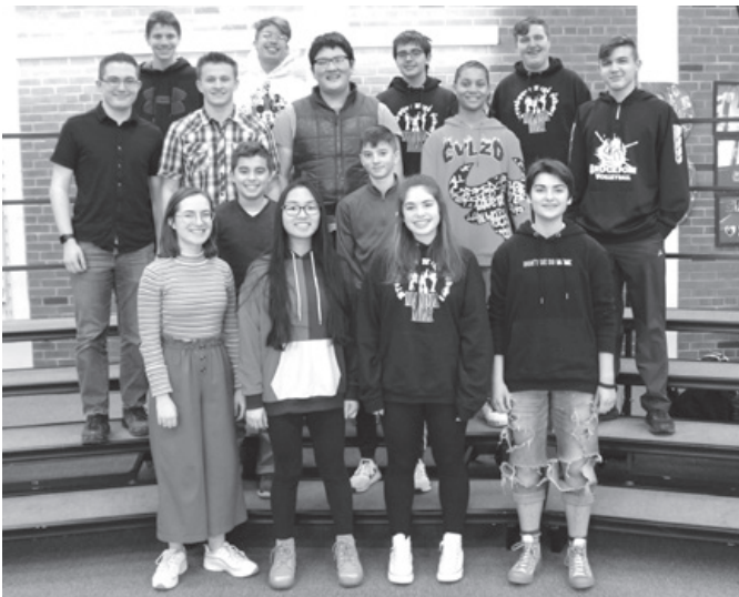
The following students were selected for the Monroe County School Music Association (MCSMA) Jazz All-County.